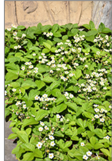
Common Wild Strawberry in bloom

Common Wild Strawberry features dainty white cup-shaped flowers with yellow eyes along the stems from late spring to early summer. Its attractive tomentose round compound leaves remain green in color throughout the season. It features an abundance of magnificent cherry red berries from late spring to late summer.