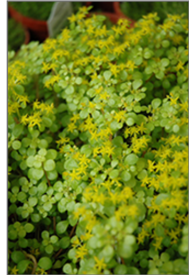
Golden Stonecrop flowers

* This is a 'special order' plant - contact store for details