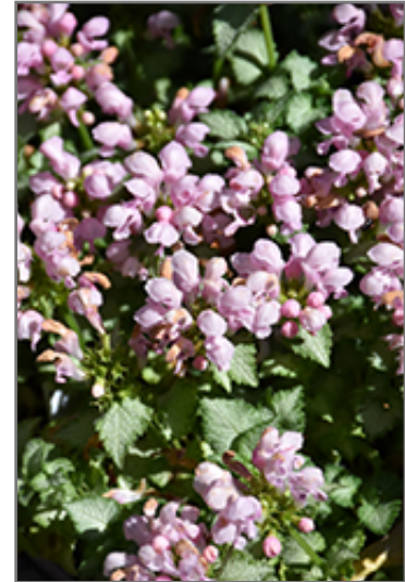
Pink Pewter Spotted Dead Nettle flowers

Pink Pewter Spotted Dead Nettle is recommended for the following landscape applications;