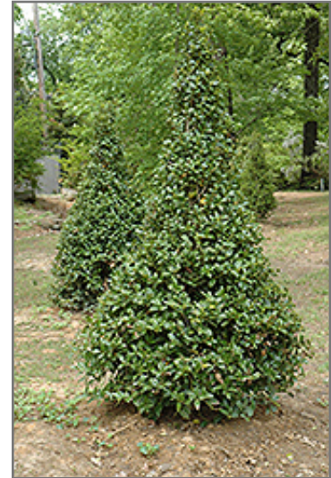
Castle Spire Meserve Holly