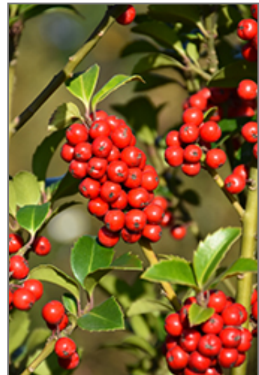
Castle Spire Meserve Holly fruit