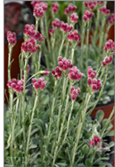
Red Pussytoes flowers

Red Pussytoes is recommended for the following landscape applications;