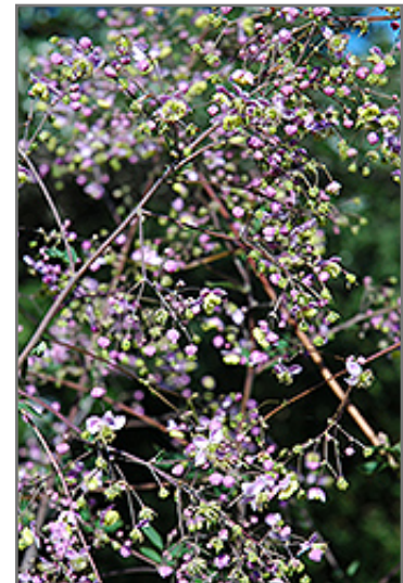
Rochebrun Meadow Rue flowers