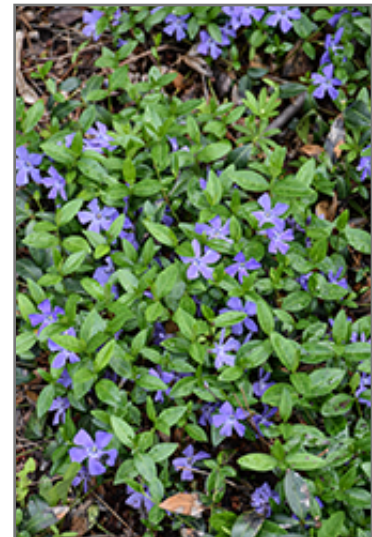
Common Periwinkle flowers