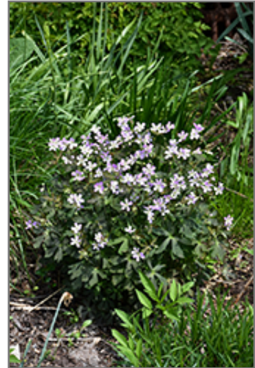
Espresso Cranesbill in bloom

Espresso Cranesbill is a fine choice for the garden, but it is also a good selection for planting in outdoor pots and containers. It is often used as a 'filler' in the 'spiller-thriller-filler' container combination, providing a mass of flowers and foliage against which the thriller plants stand out. Note that when growing plants in outdoor containers and baskets, they may require more frequent waterings than they would in the yard or garden.