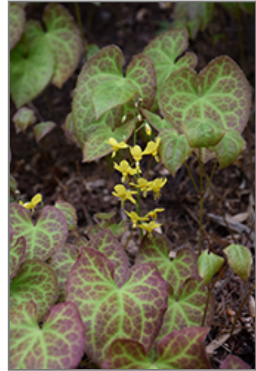
Froehnleiten Bishop's Hat flowers

Froehnleiten Bishop's Hat is a fine choice for the garden, but it is also a good selection for planting in outdoor pots and containers. Because of its spreading habit of growth, it is ideally suited for use as a 'spiller' in the 'spiller-thriller-filler' container combination; plant it near the edges where it can spill gracefully over the pot. Note that when growing plants in outdoor containers and baskets, they may require more frequent waterings than they would in the yard or garden.