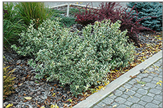
Cool Splash Bush Honeysuckle