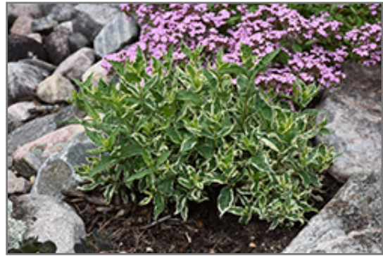
Cool Splash Bush Honeysuckle

Cool Splash Bush Honeysuckle makes a fine choice for the outdoor landscape, but it is also well-suited for use in outdoor pots and containers. Because of its height, it is often used as a 'thriller' in the 'spiller-thriller-filler' container combination; plant it near the center of the pot, surrounded by smaller plants and those that spill over the edges. It is even sizeable enough that it can be grown alone in a suitable container. Note that when grown in a container, it may not perform exactly as indicated on the tag - this is to be expected. Also note that when growing plants in outdoor containers and baskets, they may require more frequent waterings than they would in the yard or garden.