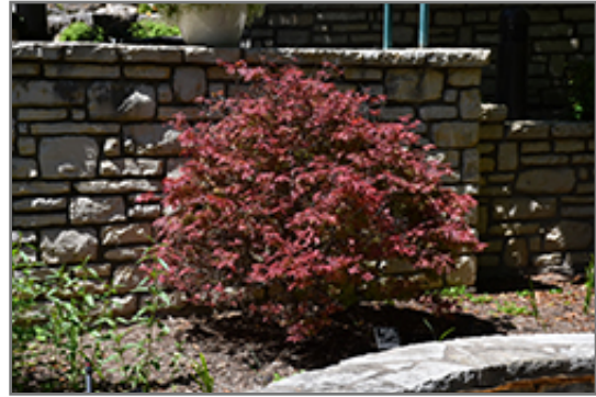
Shaina Japanese Maple

Shaina Japanese Maple is recommended for the following landscape applications;