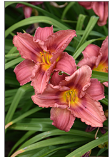
Happy Ever Appster Rosy Returns Daylily flowers

This is a relatively low maintenance plant, and is best cleaned up in early spring before it resumes active growth for the season. It is a good choice for attracting butterflies to your yard. It has no significant negative characteristics.