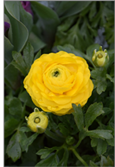
Double Meadow Buttercup flowers