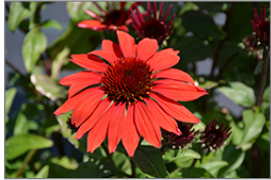
Panama Red Coneflower flowers

This is a relatively low maintenance plant, and is best cleaned up in early spring before it resumes active growth for the season. It is a good choice for attracting birds and butterflies to your yard, but is not particularly attractive to deer who tend to leave it alone in favor of tastier treats. It has no significant negative characteristics.