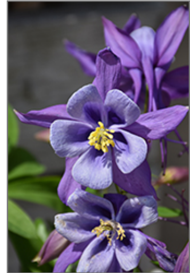
Earlybird Purple and Blue Columbine flowers

Earlybird Purple and Blue Columbine is recommended for the following landscape applications;