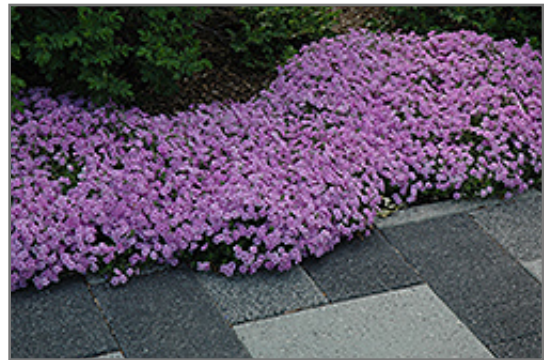
Fort Hill Moss Phlox in bloom