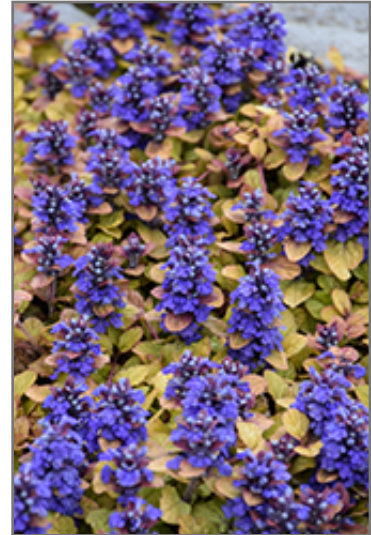
Feathered Friends Parrot Paradise Bugleweed in bloom

Feathered Friends Parrot Paradise Bugleweed is a dense herbaceous evergreen perennial with a ground-hugging habit of growth. Its relatively fine texture sets it apart from other garden plants with less refined foliage.