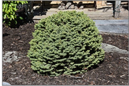
Dwarf Serbian Spruce