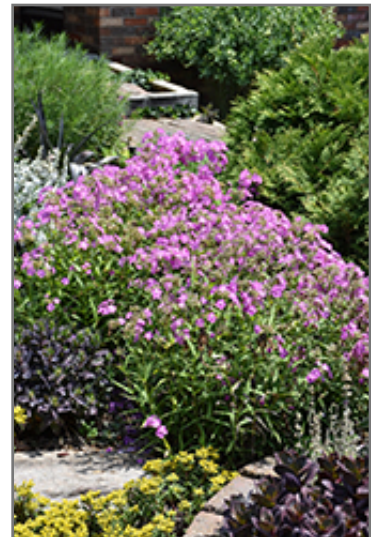
Opening Act Ultrapink Phlox in bloom