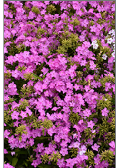
Opening Act Ultrapink Phlox flowers

Opening Act Ultrapink Phlox will grow to be about 22 inches tall at maturity, with a spread of 3 feet. When grown in masses or used as a bedding plant, individual plants should be spaced approximately 32 inches apart. Its foliage tends to remain dense right to the ground, not requiring facer plants in front. It grows at a fast rate, and under ideal conditions can be expected to live for approximately 1 years. As an herbaceous perennial, this plant will usually die back to the crown each winter, and will regrow from the base each spring. Be careful not to disturb the crown in late winter when it may not be readily seen!