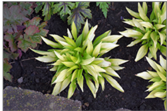
Munchkin Fire Hosta