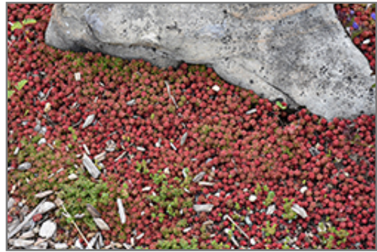
Coral Carpet Stonecrop

Coral Carpet Stonecrop is a dense herbaceous evergreen perennial with a ground-hugging habit of growth. Its medium texture blends into the garden, but can always be balanced by a couple of finer or coarser plants for an effective composition.