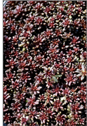
Coral Carpet Stonecrop

Coral Carpet Stonecrop is a fine choice for the garden, but it is also a good selection for planting in outdoor pots and containers. Because of its spreading habit of growth, it is ideally suited for use as a 'spiller' in the 'spiller-thriller-filler' container combination; plant it near the edges where it can spill gracefully over the pot. Note that when growing plants in outdoor containers and baskets, they may require more frequent waterings than they would in the yard or garden.