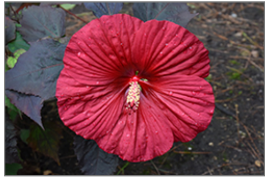
Summerific Holy Grail Hibiscus flowers

Summerific Holy Grail Hibiscus is an herbaceous perennial with an upright spreading habit of growth. Its relatively coarse texture can be used to stand it apart from other garden plants with finer foliage.