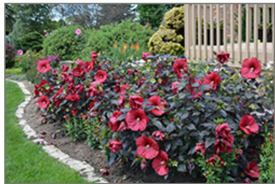
Summerific Holy Grail Hibiscus in bloom