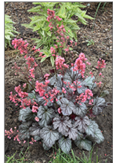
Timeless Treasure Coral Bells in bloom