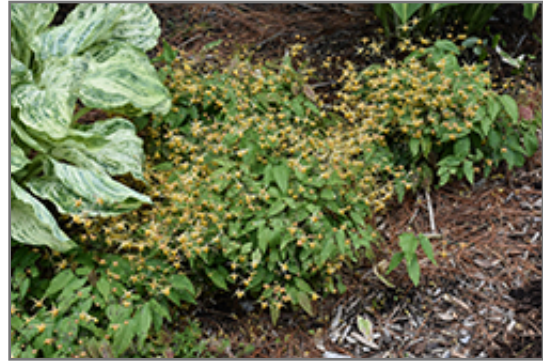
Amber Queen Barrenwort in bloom