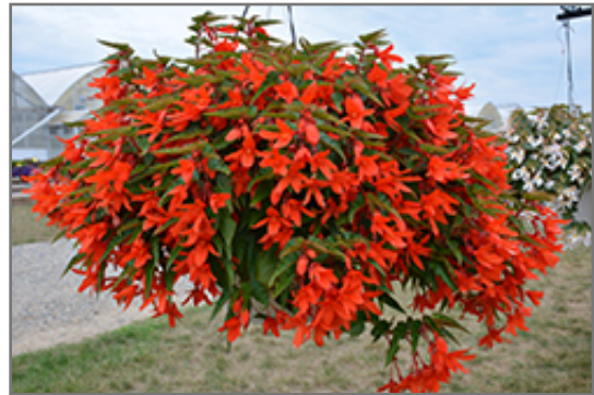
Waterfall Encanto Orange Begonia in bloom