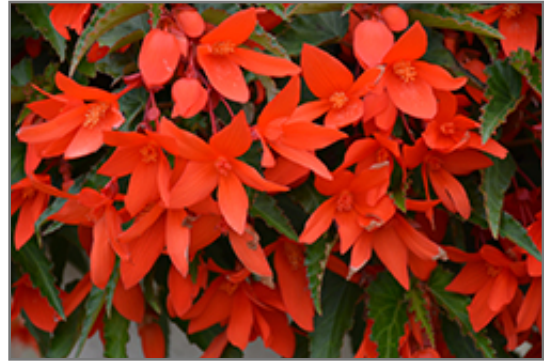
Waterfall Encanto Orange Begonia flowers

Waterfall Encanto Orange Begonia is an herbaceous annual with a trailing habit of growth, eventually spilling over the edges of hanging baskets and containers. Its medium texture blends into the garden, but can always be balanced by a couple of finer or coarser plants for an effective composition.