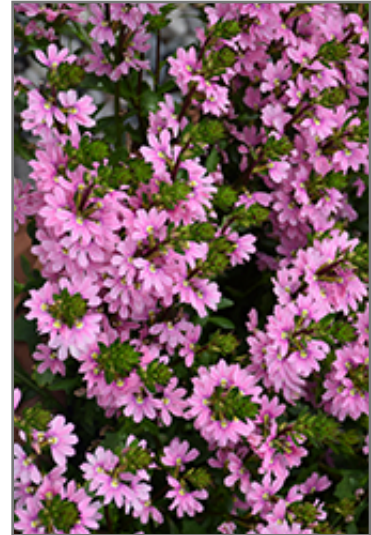
Whirlwind Pink Fan Flower flowers

Whirlwind Pink Fan Flower is recommended for the following landscape applications;