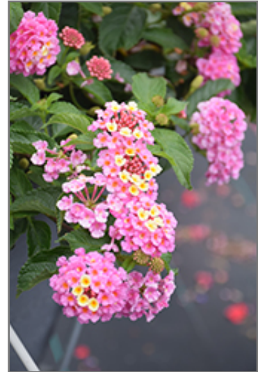
Luscious Pinkberry Blend Lantana flowers