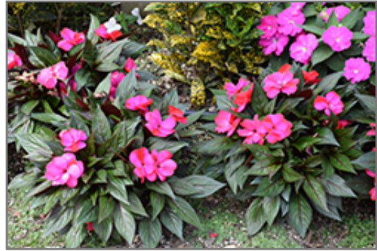
Infinity Blushing Lilac New Guinea Impatiens in bloom

Infinity Blushing Lilac New Guinea Impatiens will grow to be about 12 inches tall at maturity, with a spread of 12 inches. When grown in masses or used as a bedding plant, individual plants should be spaced approximately 8 inches apart. Its foliage tends to remain dense right to the ground, not requiring facer plants in front. This fast-growing annual will normally live for one full growing season, needing replacement the following year.