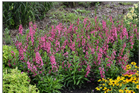
Angelface Perfectly Pink Angelonia in bloom