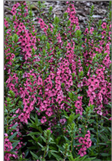
Angelface Perfectly Pink Angelonia flowers

Angelface Perfectly Pink Angelonia is a fine choice for the garden, but it is also a good selection for planting in outdoor containers and hanging baskets. With its upright habit of growth, it is best suited for use as a 'thriller' in the 'spiller-thriller-filler' container combination; plant it near the center of the pot, surrounded by smaller plants and those that spill over the edges. Note that when growing plants in outdoor containers and baskets, they may require more frequent waterings than they would in the yard or garden.