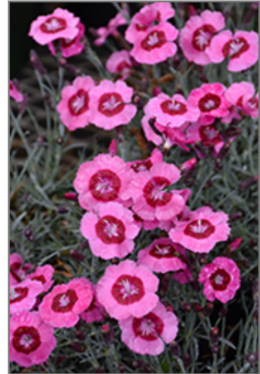
Star Single Peppermint Star Pinks flowers

* This is a 'special order' plant - contact store for details