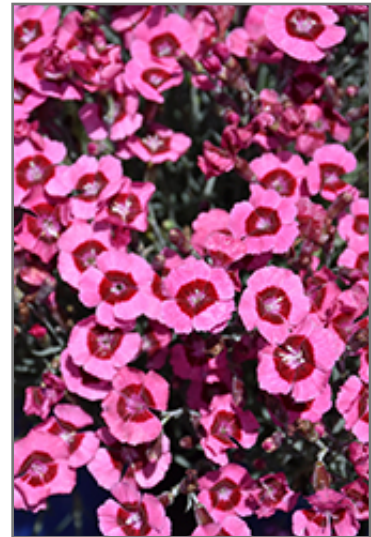
Star Single Peppermint Star Pinks flowers

Star Single Peppermint Star Pinks is an herbaceous evergreen perennial with a mounded form. It brings an extremely fine and delicate texture to the garden composition and should be used to full effect.