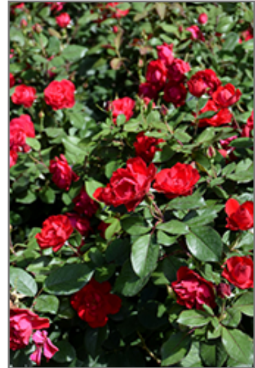
Oso Easy Double Red Rose flowers

This shrub should only be grown in full sunlight. It does best in average to evenly moist conditions, but will not tolerate standing water. It is not particular as to soil type or pH. It is somewhat tolerant of urban pollution. This particular variety is an interspecific hybrid.