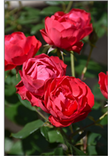
Oso Easy Double Red Rose flowers

Oso Easy Double Red Rose is recommended for the following landscape applications;