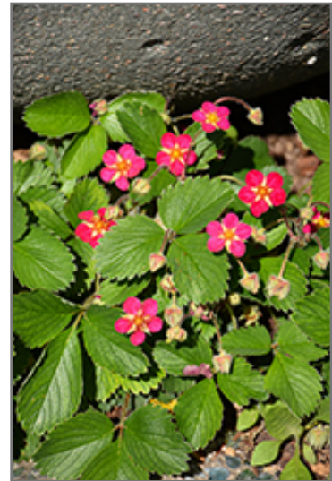
Lipstick Strawberry flowers

Lipstick Strawberry has masses of beautiful cherry red daisy flowers with yellow eyes along the stems from late spring to early summer, which are most effective when planted in groupings. Its tomentose round compound leaves remain green in color throughout the season. It features an abundance of magnificent red berries from mid spring to mid fall.