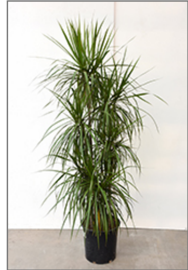
Red-edge Dracaena

When grown indoors, Red-edge Dracaena can be expected to grow to be about 8 feet tall at maturity, with a spread of 4 feet. It grows at a medium rate, and under ideal conditions can be expected to live for approximately 10 years. This houseplant performs well in both bright or indirect sunlight and strong artificial light, and can therefore be situated in almost any well-lit room or location. It does best in average to evenly moist soil, but will not tolerate standing water. The surface of the soil shouldn't be allowed to dry out completely, and so you should expect to water this plant once and possibly even twice each week. Be aware that your particular watering schedule may vary depending on its location in the room, the pot size, plant size and other conditions; if in doubt, ask one of our experts in the store for advice. It is not particular as to soil type or pH; an average potting soil should work just fine.