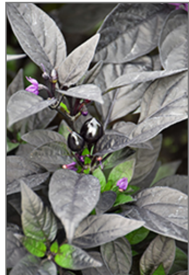
Black Pearl Ornamental Pepper fruit