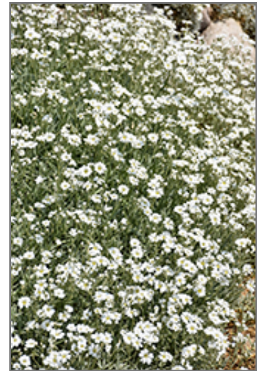
Snow-In-Summer in bloom