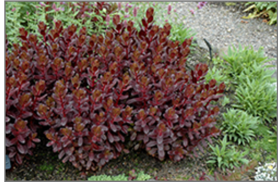
Touchdown Teak Stonecrop

Touchdown Teak Stonecrop is a dense herbaceous perennial with an upright spreading habit of growth. Its medium texture blends into the garden, but can always be balanced by a couple of finer or coarser plants for an effective composition.