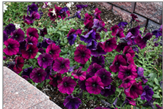
Easy Wave Burgundy Velour Petunia flowers