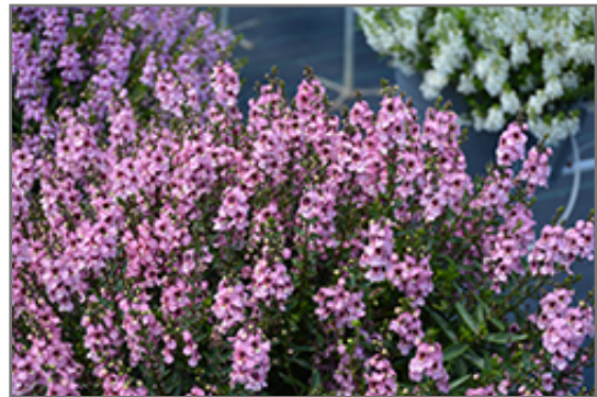
Serenita Pink Angelonia in bloom