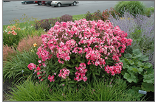
Garden Girls Glamour Girl Garden Phlox in bloom

Garden Girls Glamour Girl Garden Phlox will grow to be about 28 inches tall at maturity, with a spread of 24 inches. When grown in masses or used as a bedding plant, individual plants should be spaced approximately 18 inches apart. It grows at a medium rate, and under ideal conditions can be expected to live for approximately 10 years. As an herbaceous perennial, this plant will usually die back to the crown each winter, and will regrow from the base each spring. Be careful not to disturb the crown in late winter when it may not be readily seen!