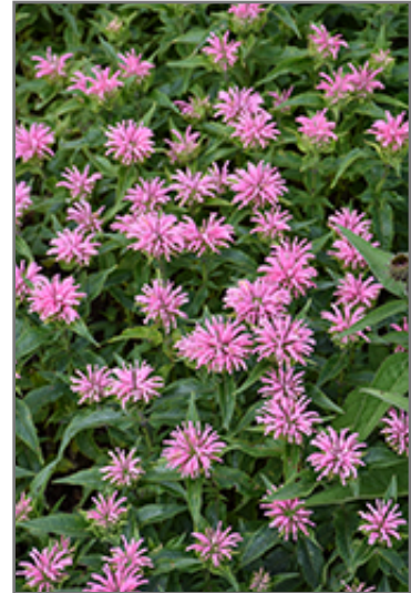
Pardon My Pink Beebalm flowers