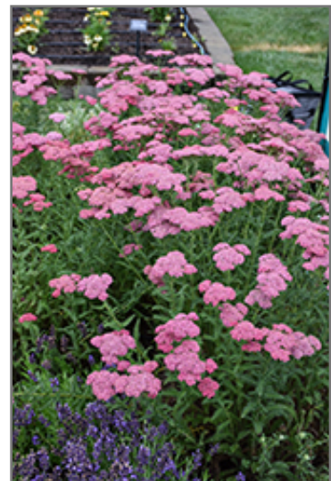
New Vintage Rose Yarrow in bloom