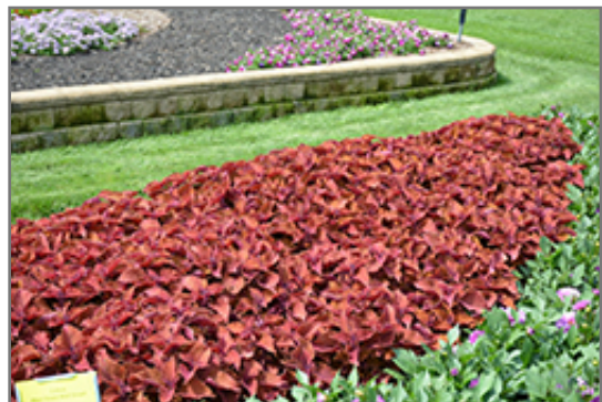
Wall Street Coleus