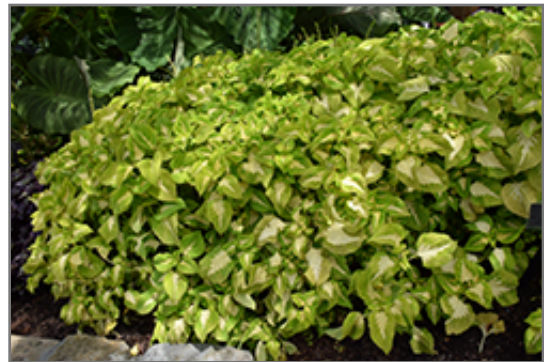
Kong Jr. Green Halo Coleus