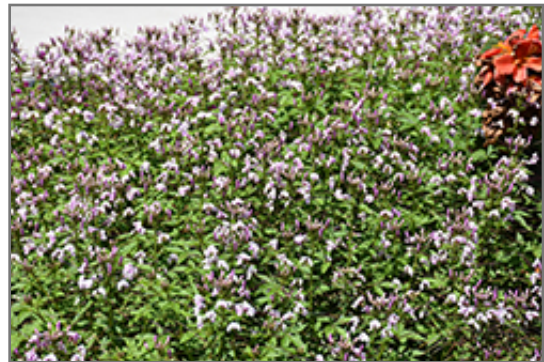
Clio Magenta Spiderflower in bloom