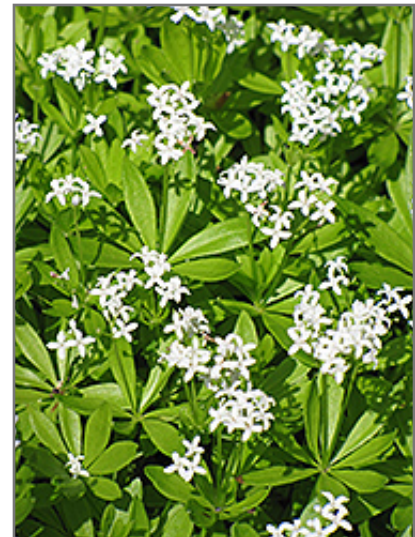
Sweet Woodruff flowers