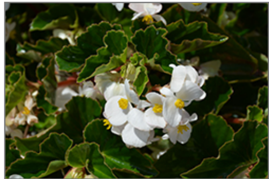
BabyWing White Begonia flowers