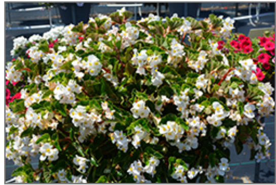
BabyWing White Begonia in bloom

BabyWing White Begonia is a fine choice for the garden, but it is also a good selection for planting in outdoor containers and hanging baskets. It is often used as a 'filler' in the 'spiller-thriller-filler' container combination, providing a mass of flowers and foliage against which the thriller plants stand out. Note that when growing plants in outdoor containers and baskets, they may require more frequent waterings than they would in the yard or garden.