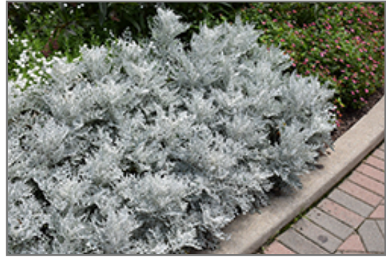
Silver Dust Dusty Miller

Silver Dust Dusty Miller is recommended for the following landscape applications;