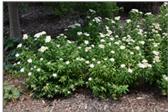
Japanese White Spirea in bloom