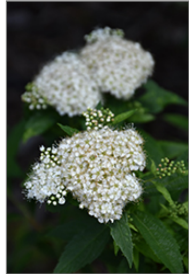
Japanese White Spirea flowers

Japanese White Spirea is recommended for the following landscape applications;