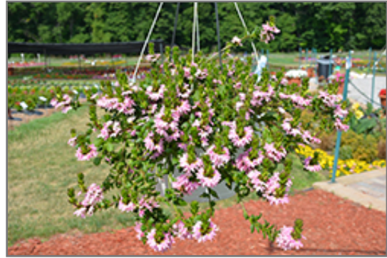
Bombay Pink Fan Flower in bloom

Bombay Pink Fan Flower is a fine choice for the garden, but it is also a good selection for planting in outdoor containers and hanging baskets. Because of its trailing habit of growth, it is ideally suited for use as a 'spiller' in the 'spiller-thriller-filler' container combination; plant it near the edges where it can spill gracefully over the pot. Note that when growing plants in outdoor containers and baskets, they may require more frequent waterings than they would in the yard or garden.