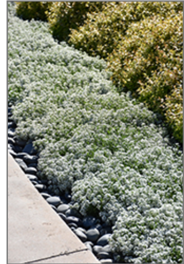
Snow Princess Alyssum in bloom

Snow Princess Alyssum is recommended for the following landscape applications;